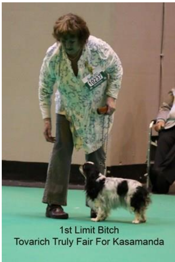
1st Limit Bitch Tovarich Truly Fair For Kasamanda