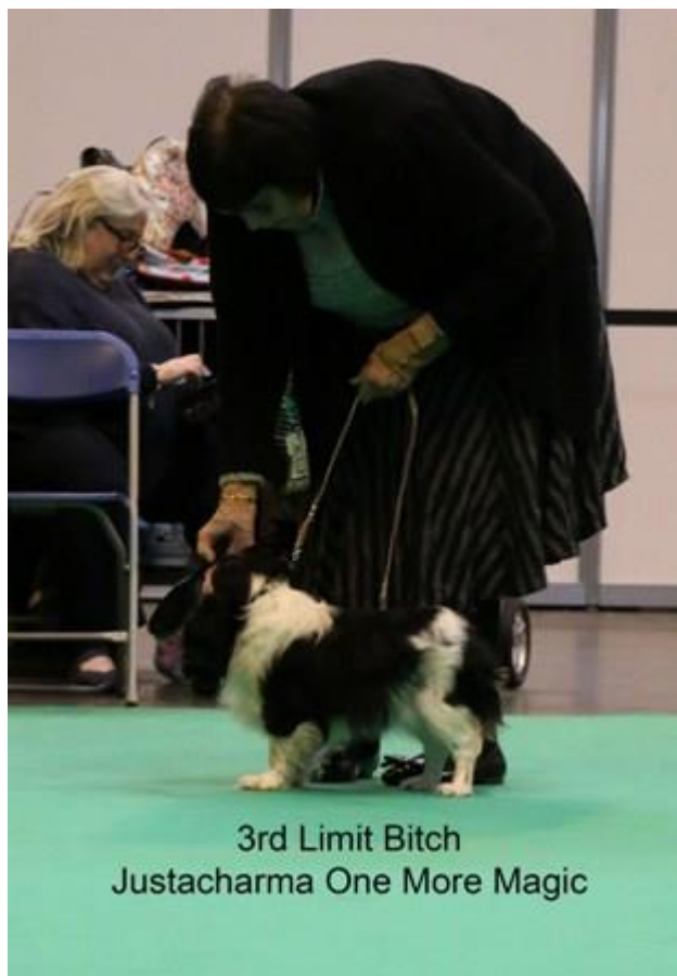
3rd Limit Bitch Justacharma One More Magic