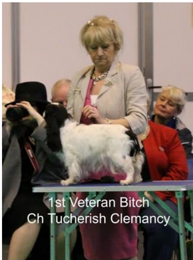
1st Veteran Bitch Ch Tucherish Clemancy