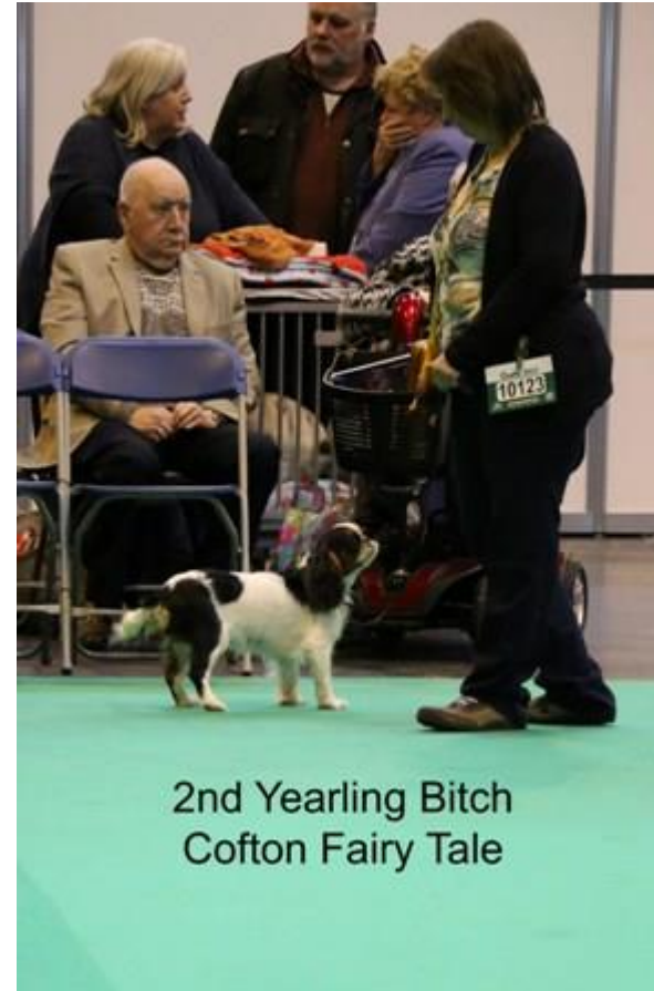
2nd Yearling Bitch Cofton Fairy Tale