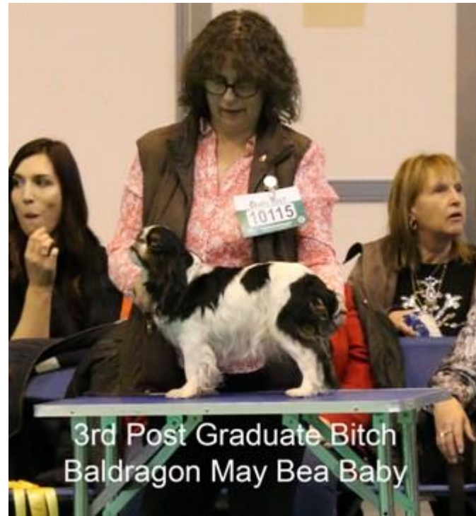
3rd Post Graduate Bitch Baldragon May Bea Baby