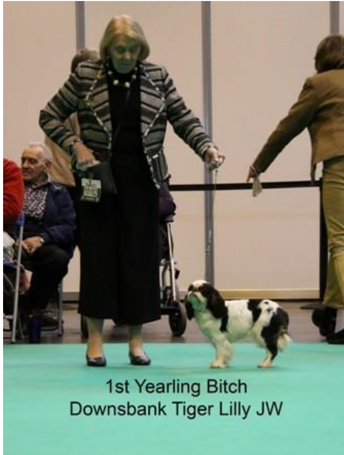
1st Yearling Bitch Downsbank Tiger Lilly JW