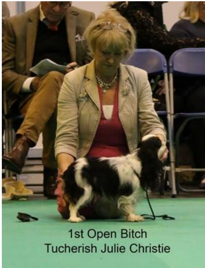
1st Open Bitch Tucherish Julie Christie