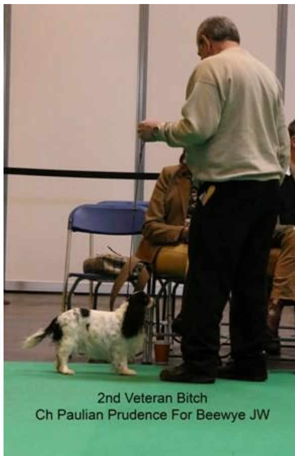
2nd Veteran Bitch Ch Paulian Prudence For Beewye JW