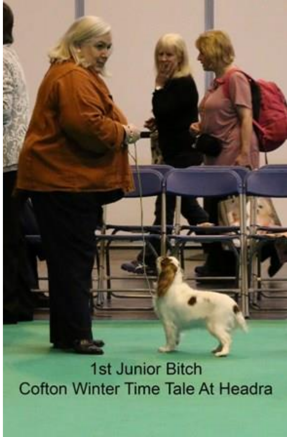
1st Junior Bitch Cofton Winter Time Tale At Headra