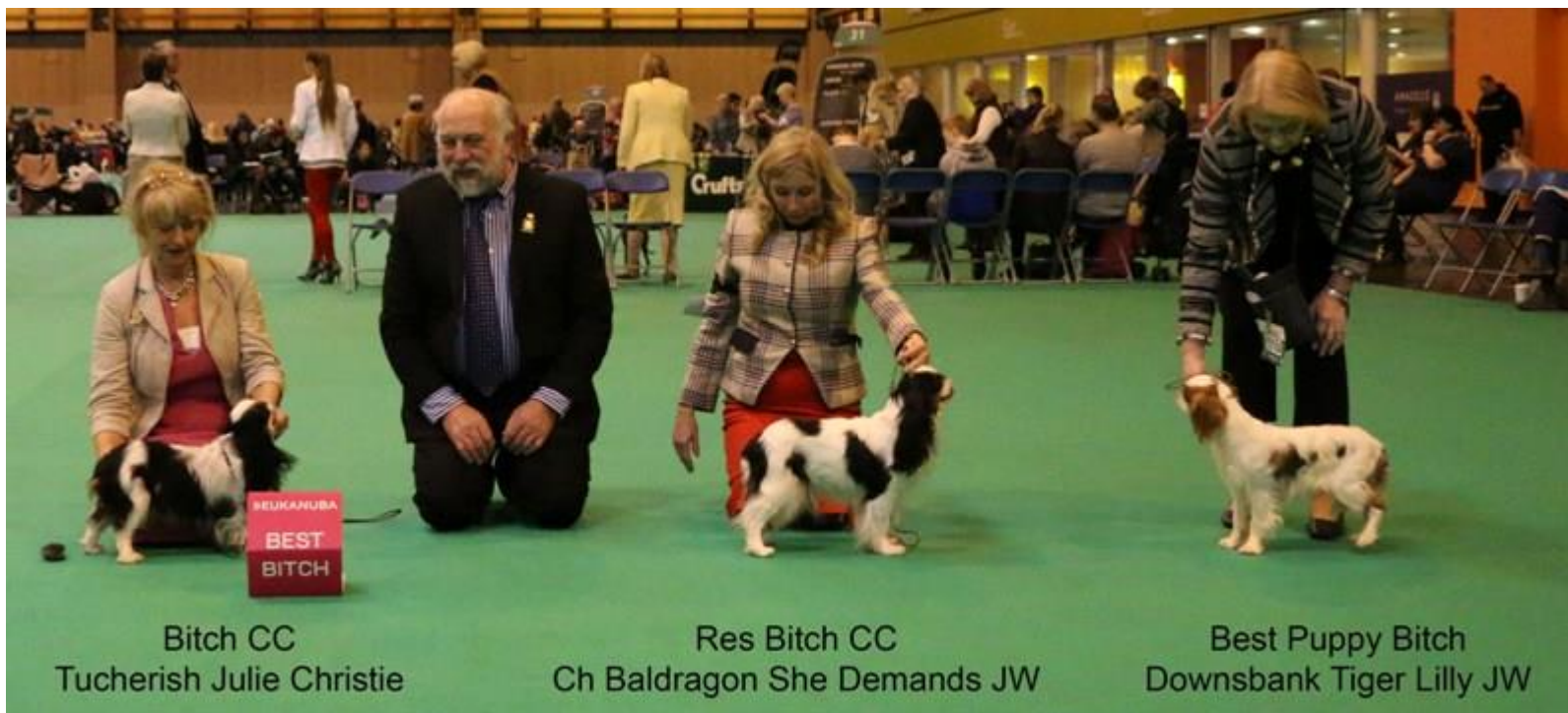
Bitch CC Tucherish Julie Christie