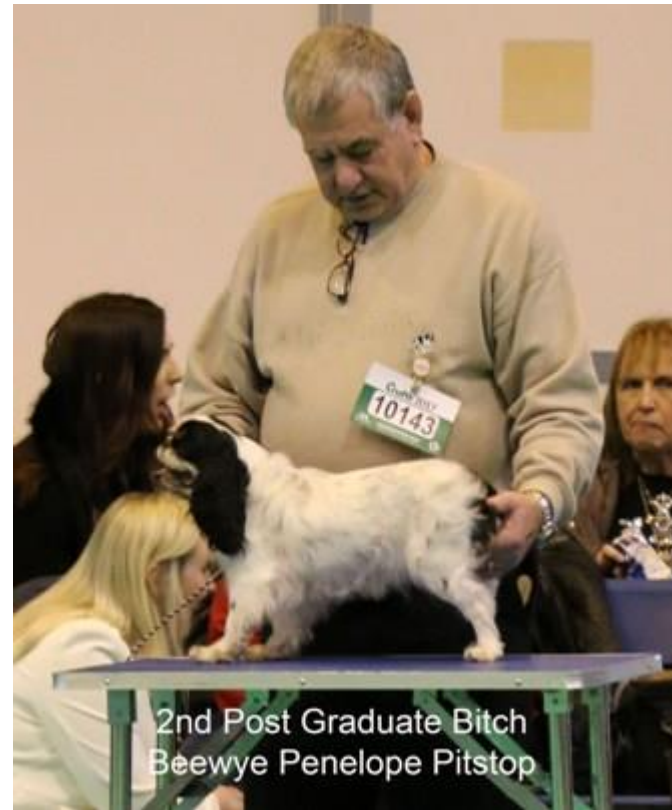
2nd Post Graduate Bitch Beewye Penelope Pitstop