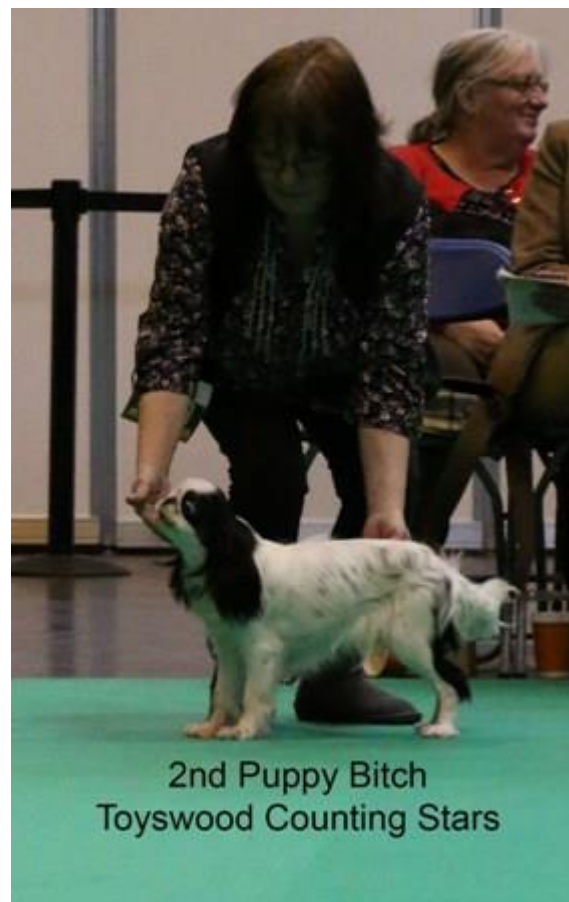
2nd Puppy Bitch Toyswood Counting Stars