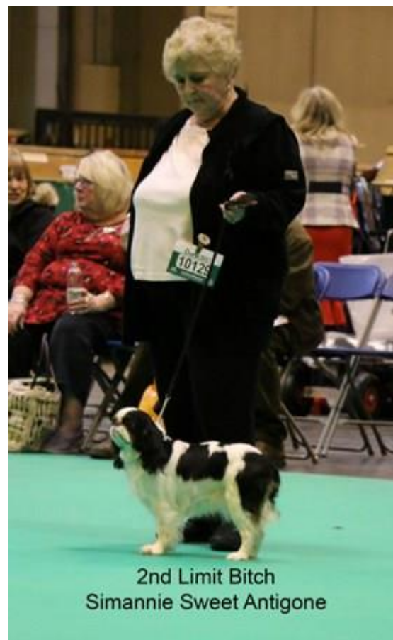
2nd Limit Bitch Simannie Sweet Antigone