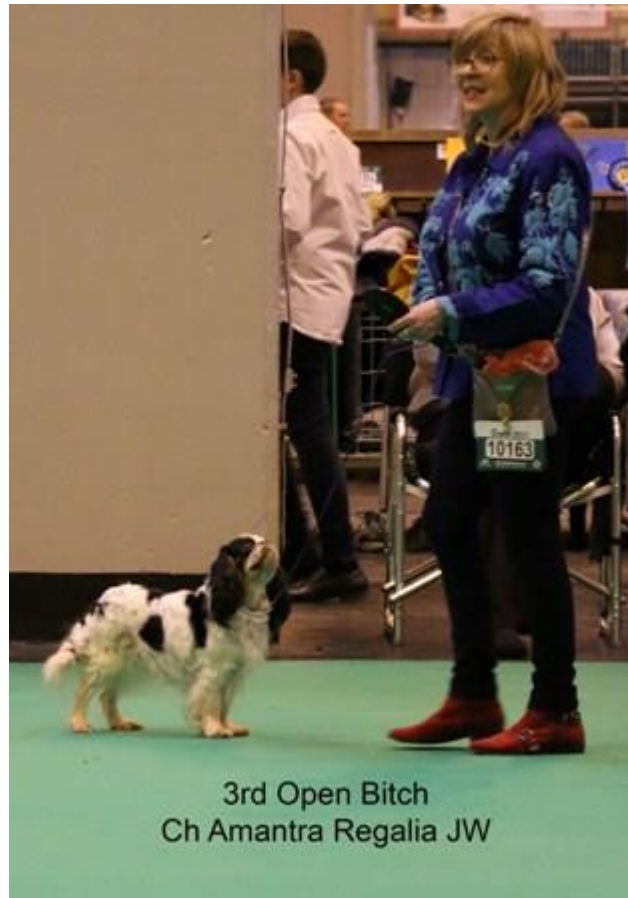
3rd Open Bitch Ch Amantra Regalia JW