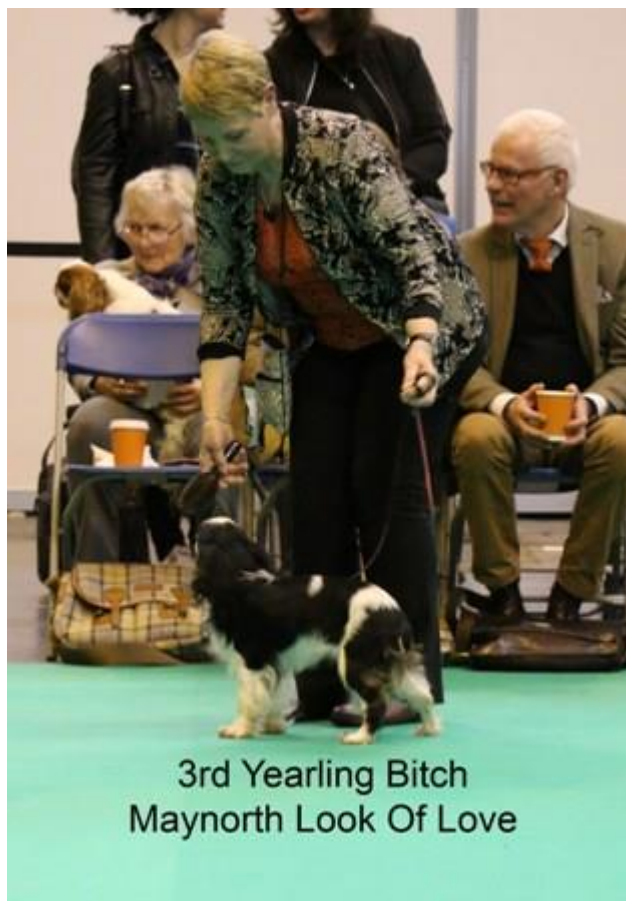
3rd Yearling Bitch Maynorth Look Of Love