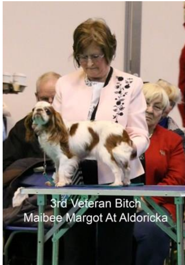
3rd Veteran Bitch Maibee Margot At Aldoricka