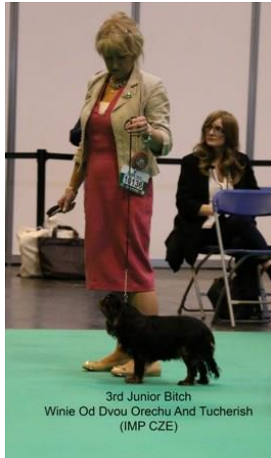
3rd Junior Bitch Winie Od Dvou Orechu And Tucherish (IMP CZE)