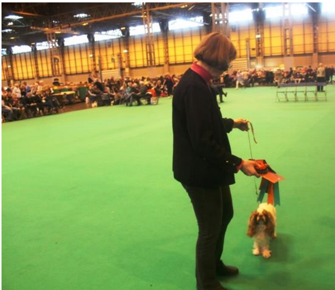
Bitch CC Line-up