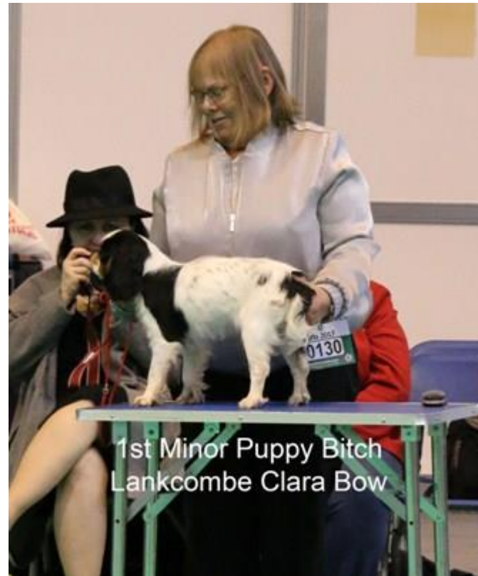
Puppy Bitch Winners