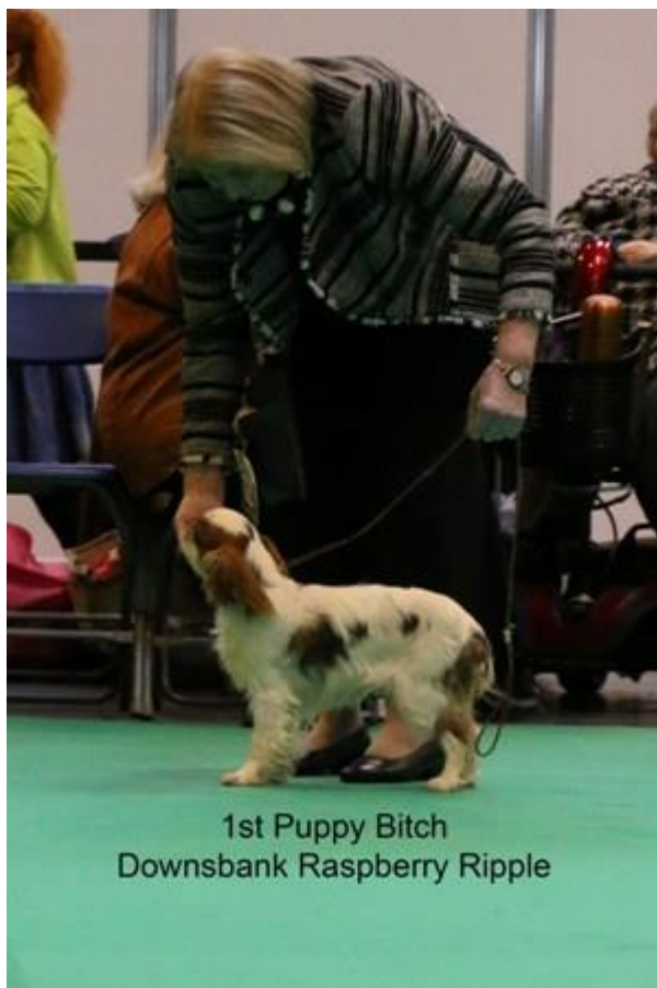
1st Puppy Bitch Downsbank Raspberry Ripple