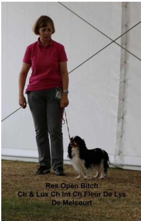
Res Open Bitch Ch & Lux Ch Int Ch Fleur De Lys De Melcourt