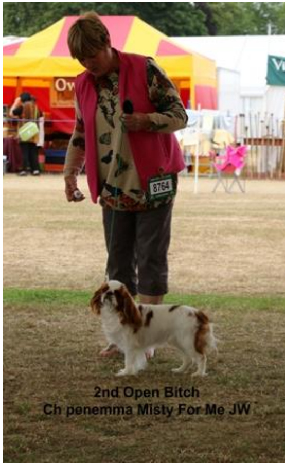
2nd Open Bitch Ch penemma Misty For Me JW