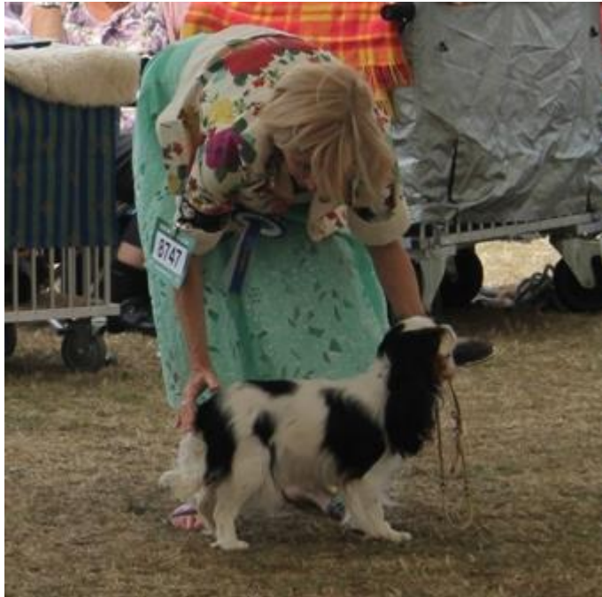
1st Open Bitch