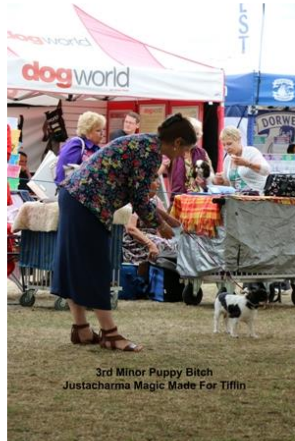
3rd Minor Puppy Bitch Justacharma Magic Made For Tiflin