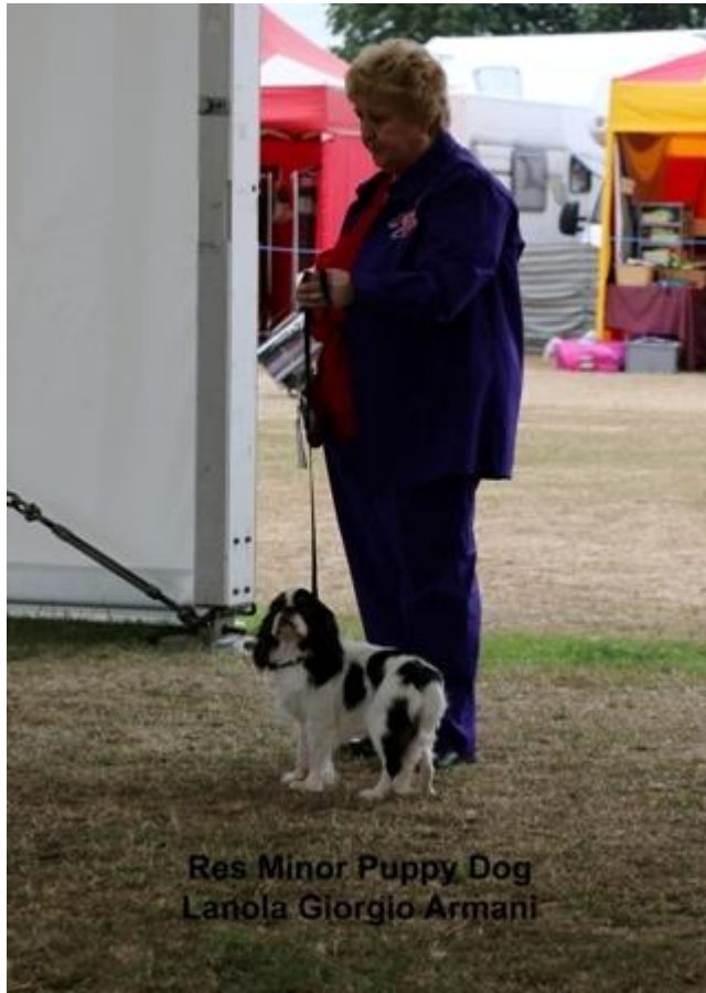
Res Minor Puppy Dog Lanola Giorgio Armani