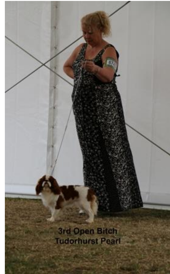
3rd Open Bitch Tudorhurst Pearl