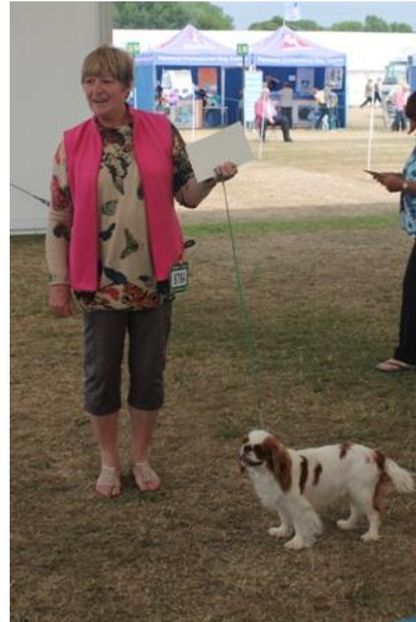
2nd Open Bitch