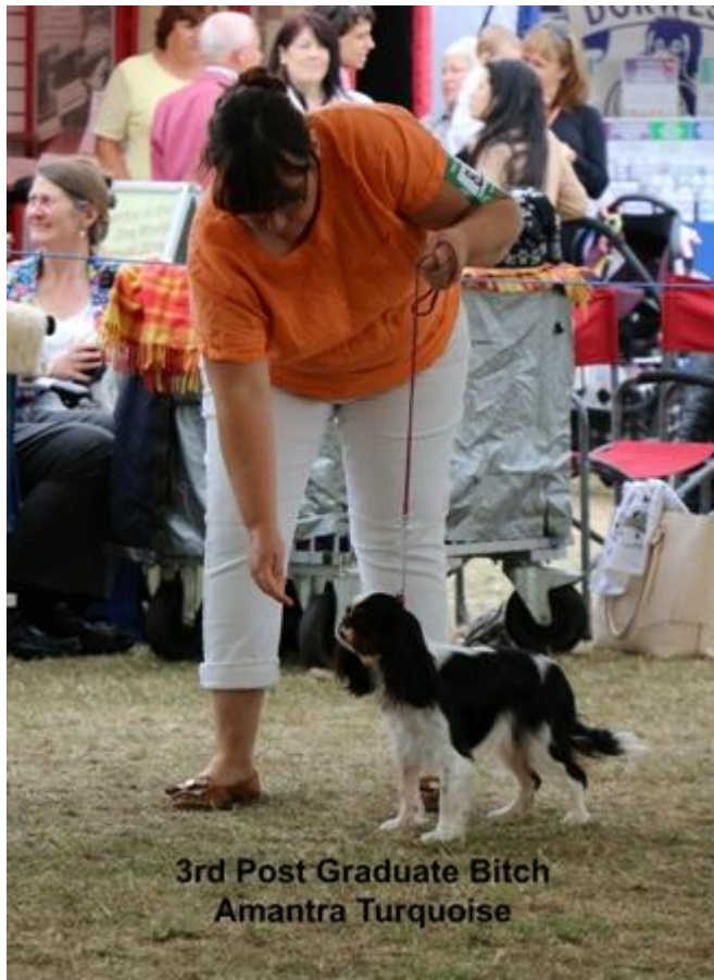
3rd Post Graduate Bitch Amantra Turquoise