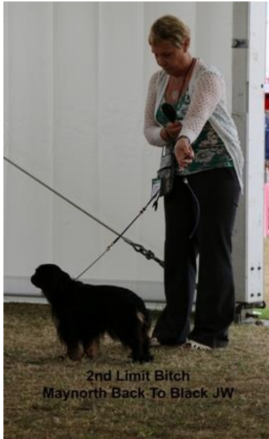
2nd Limit Bitch Maynorth Back To Black JW