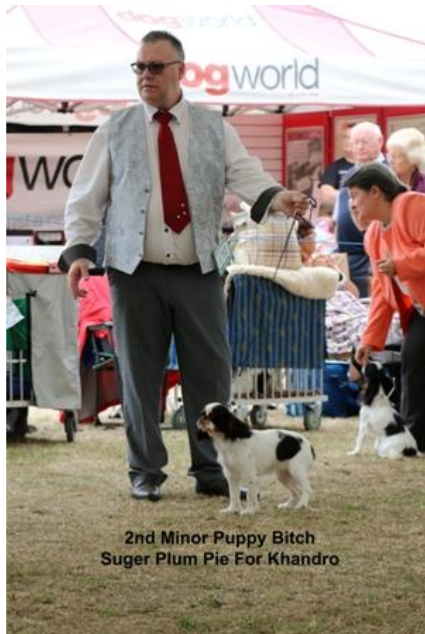
2nd Minor Puppy Bitch Suger Plum Pie For Khandro