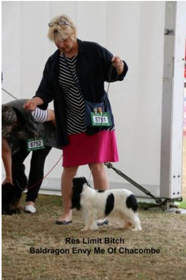
Res Limit Bitch Baldragon Envy Me Of Chacombe