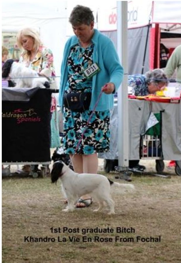
1st Post graduate Bitch Khandro La Vie En Rose From Fochal