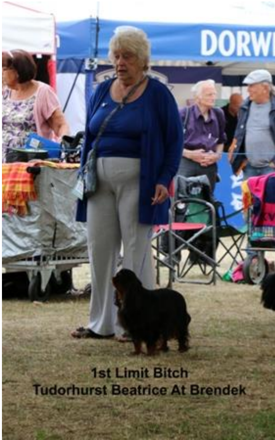
1st Limit Bitch Tudorhurst Beatrice At Brendek