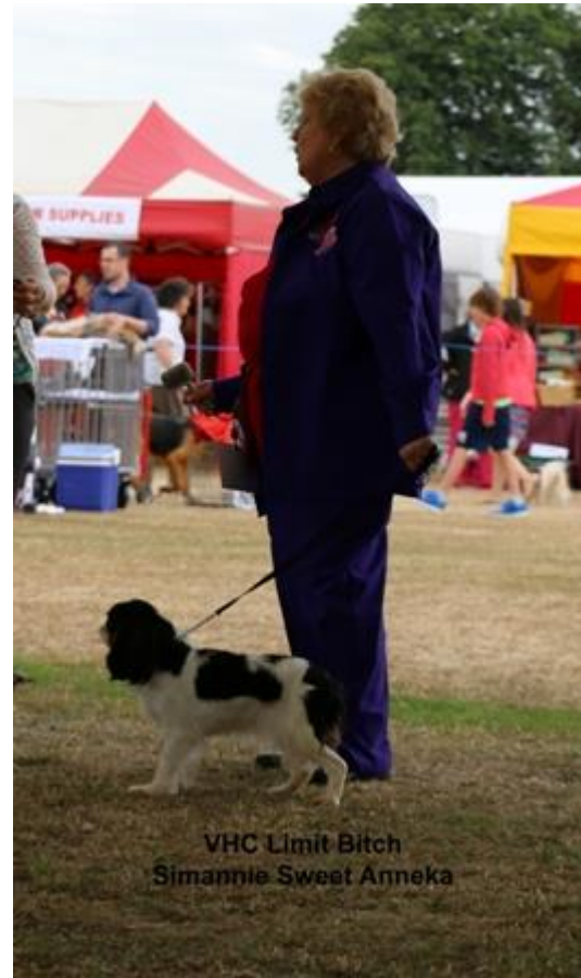
VHC Limit Bitch Simannie Sweet Annika