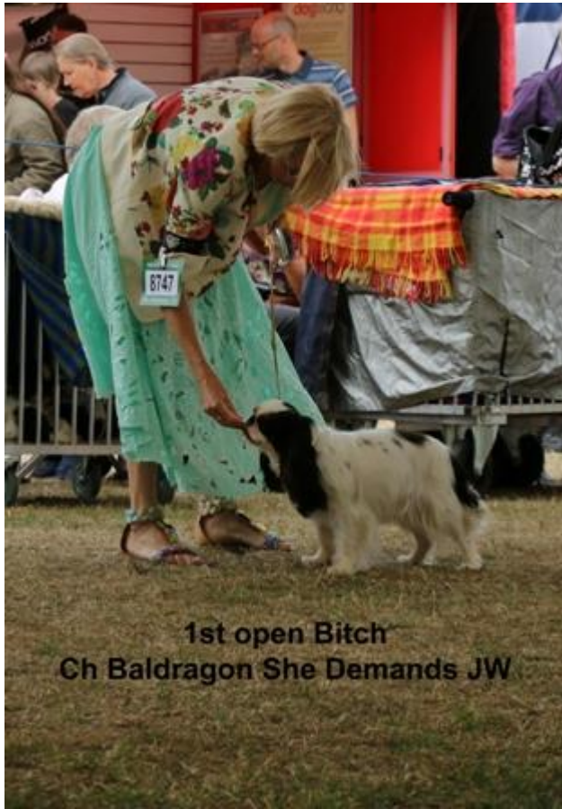
1st open Bitch Ch Baldragon She Demands JW