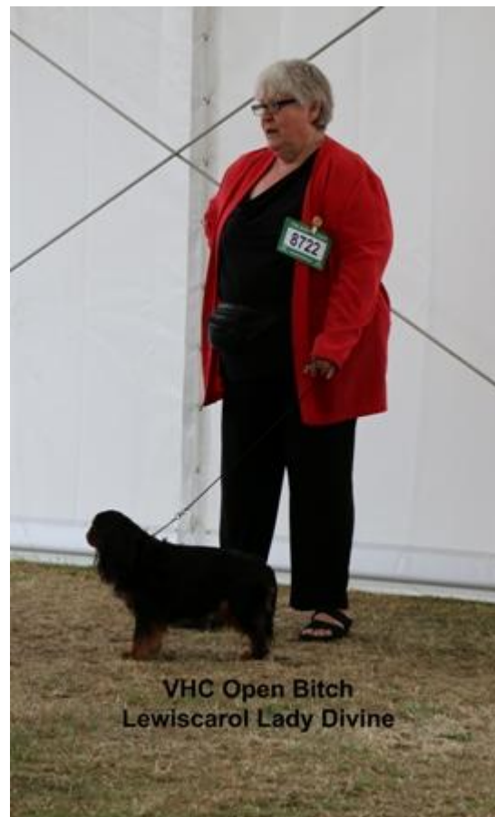
VHC Open Bitch Lewiscarol Lady Divine