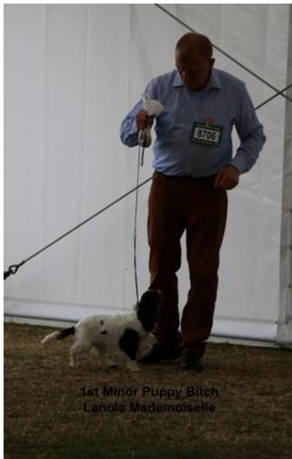
1st Minor Puppy Bitch Lanoie Mademoiselle