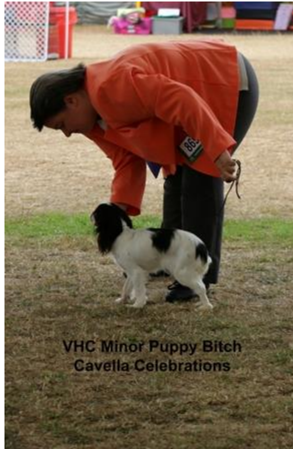
VHC Minor Puppy Bitch Cavella Celebrations