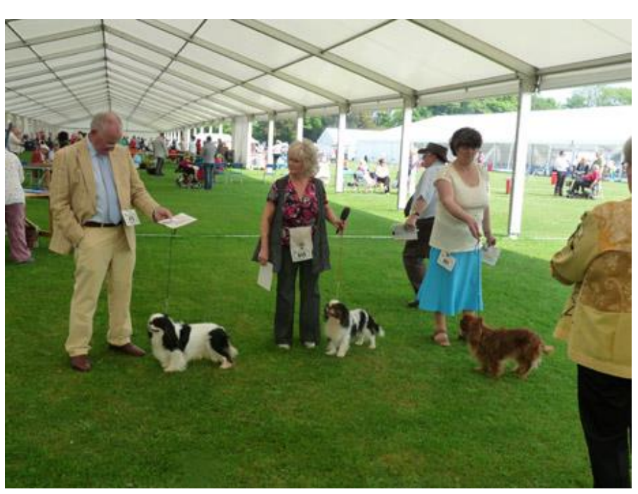
Open Dog Winners