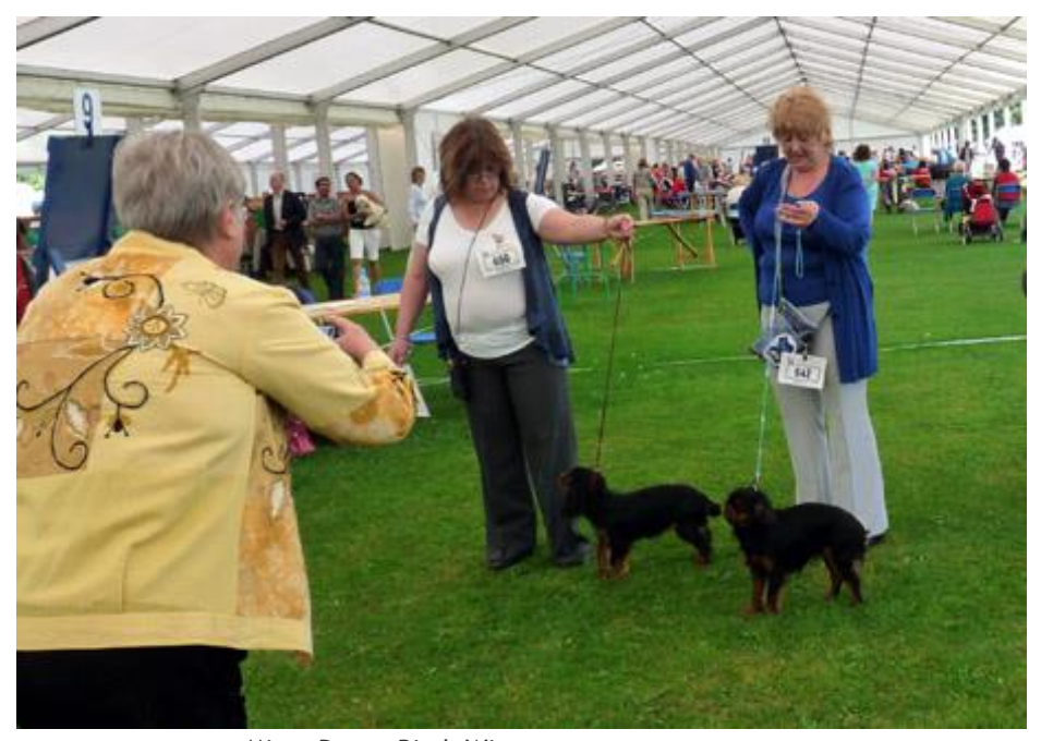
Minor Puppy Bitch Winners