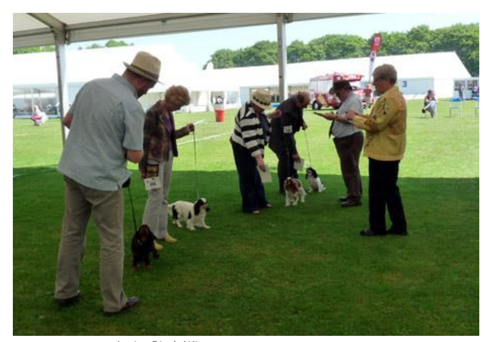
Junior Bitch Winners