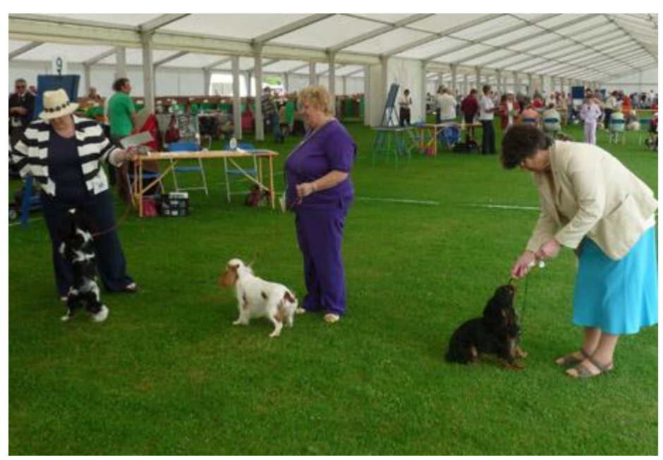
Junior Dog Winners