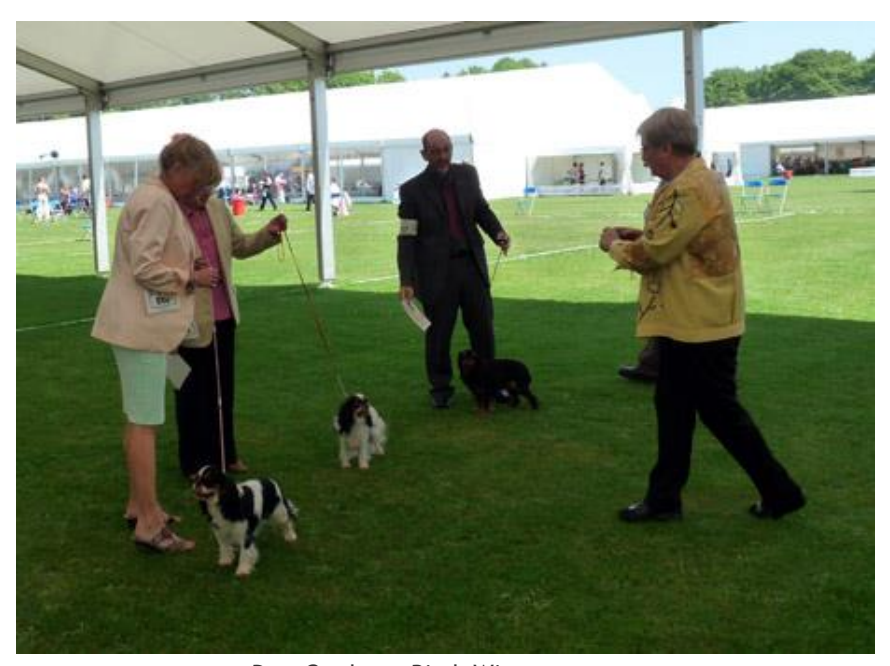
Post Graduate Bitch Winners