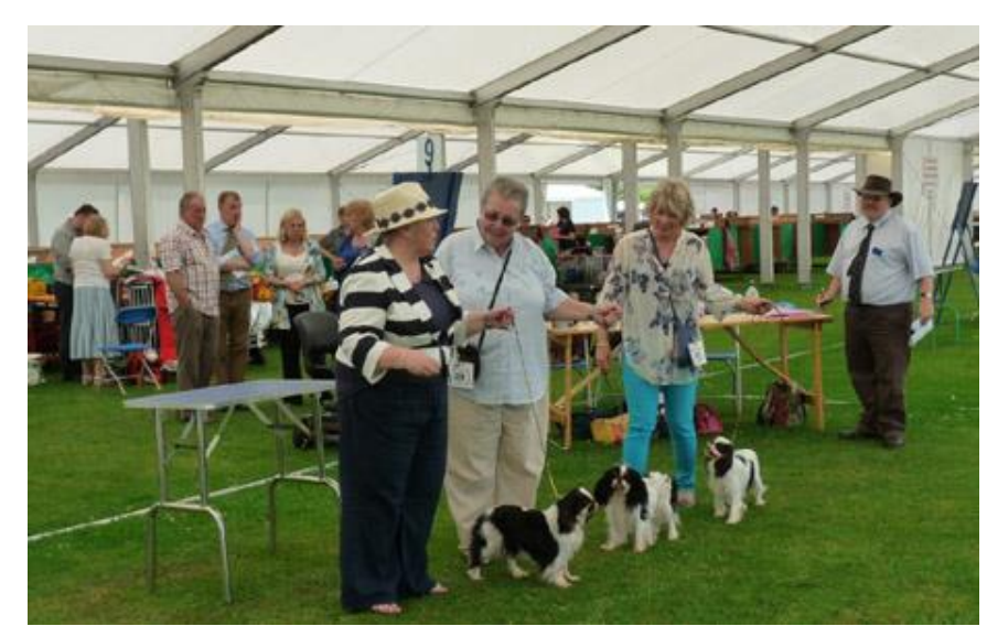
Bitch CC (her 3rd) Res Bitch Cc and Best Puppy Bitch