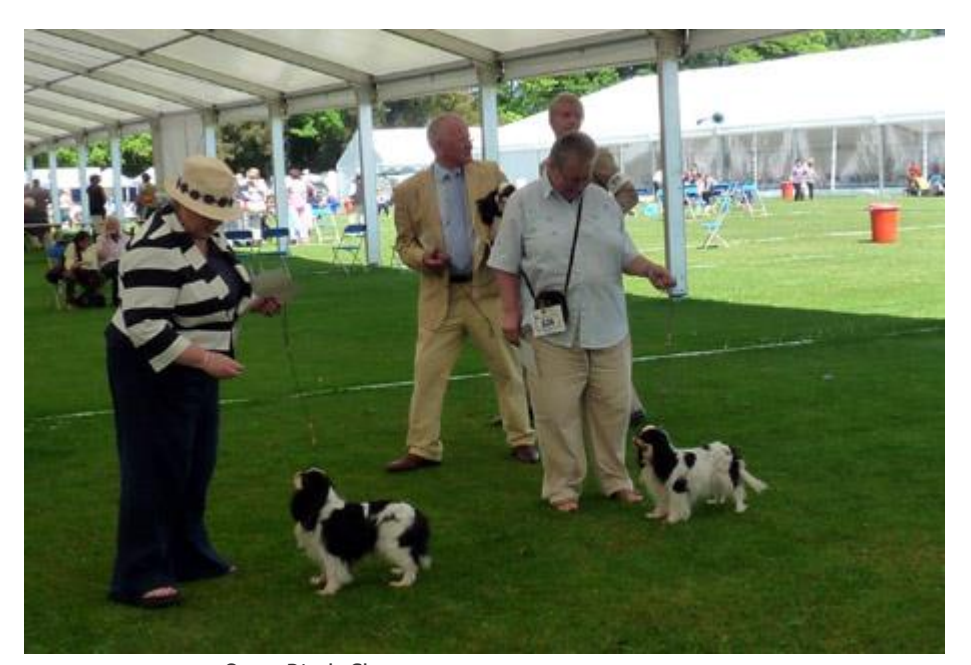
Open Bitch Class