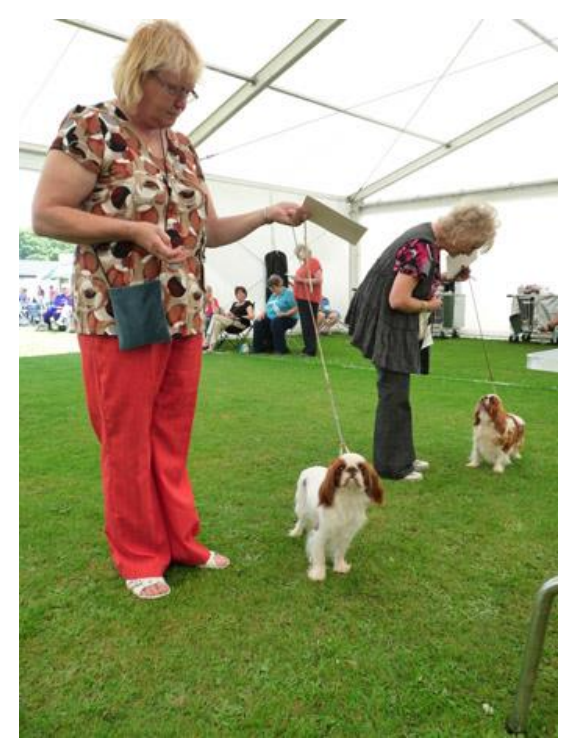
Limit Bitch Winners