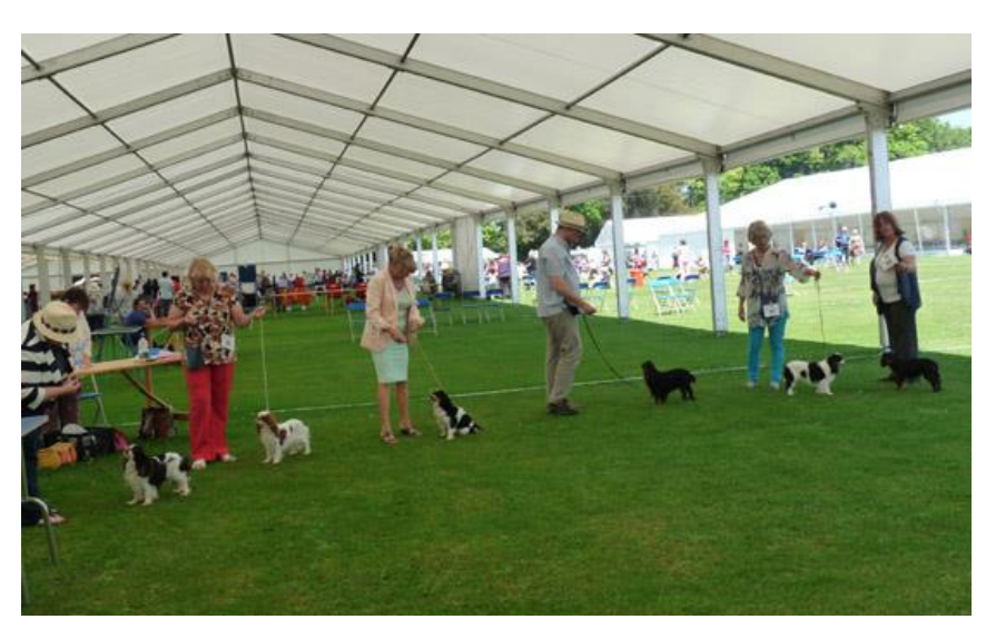
Bitch Cc Line Up