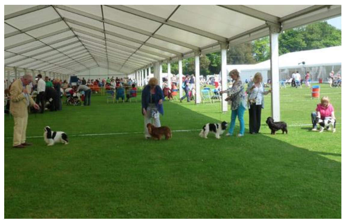
Dog CC Line Up