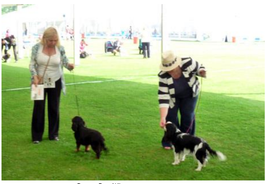
Puppy Dog Winners