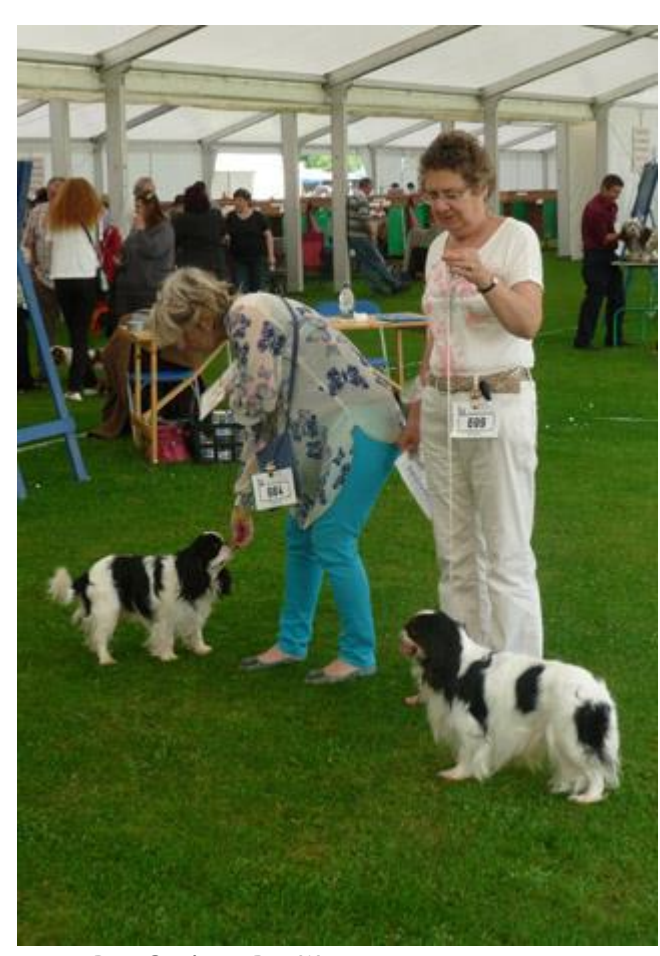
Post Graduate Dog Winners