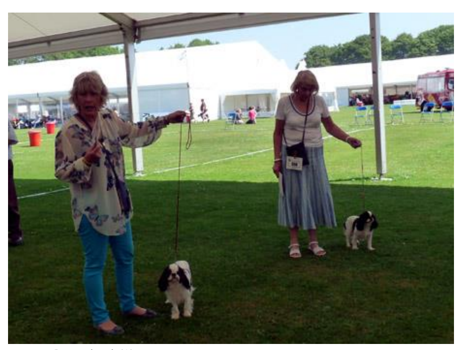
Puppy bitch Winner