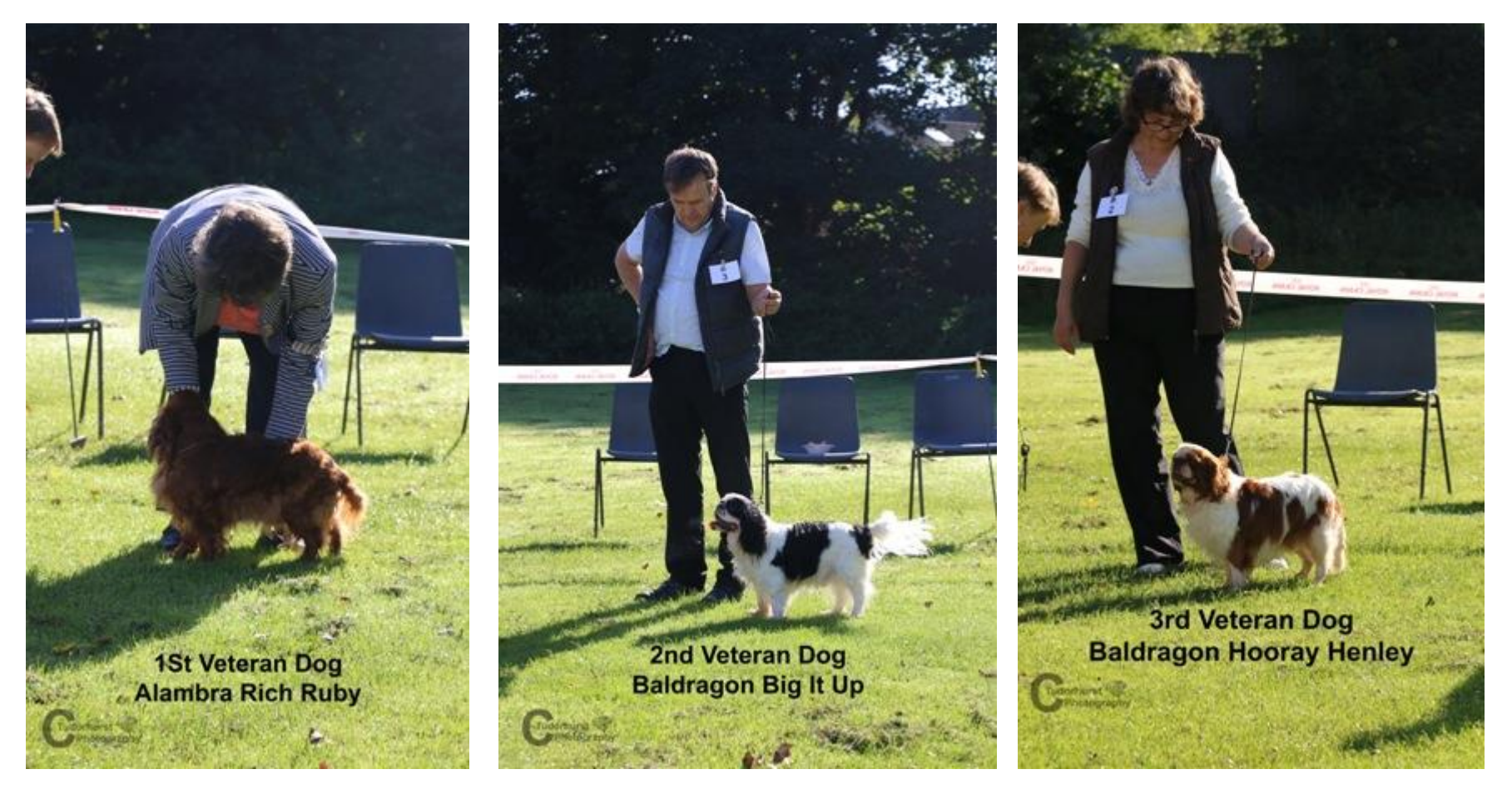
Minor Puppy Dog Winners