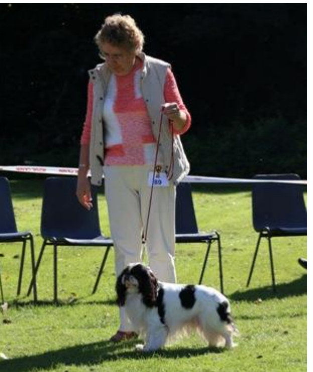
2nd Special Open Tri & Blenheim Dog Sleepyhollow Trikki Dikki at Merida