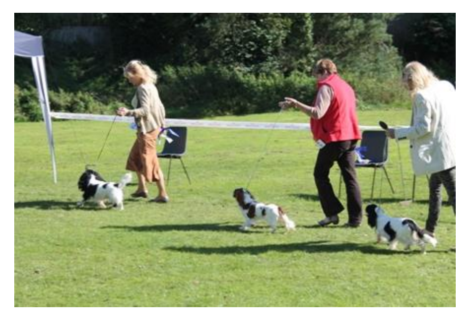
Best Dog, Res Best Dog And Best Puppy Dog