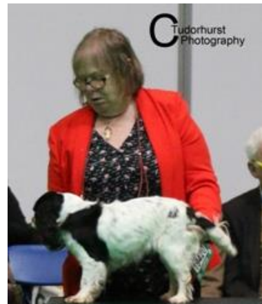
3rd Post Graduate Bitch Lankcombe Clara Bow