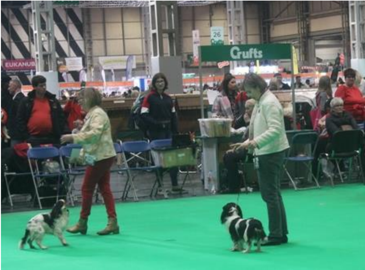
Challenge for Best Puppy