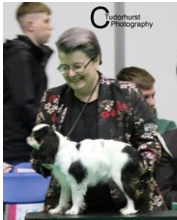
1st Minor Puppy Bitch Ellinghurst Miss Saigon