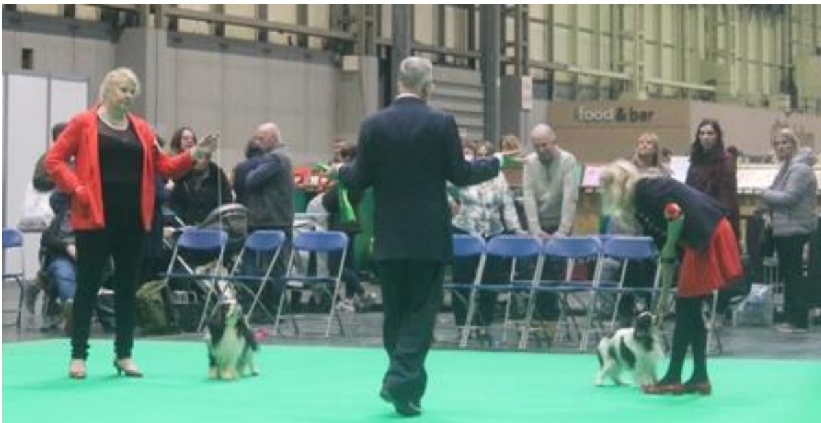
Challenge for Best Veteran