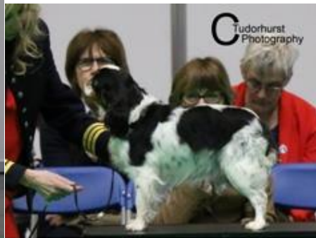
3rd Yearling Bitch My Exotic World Demands Baldragon