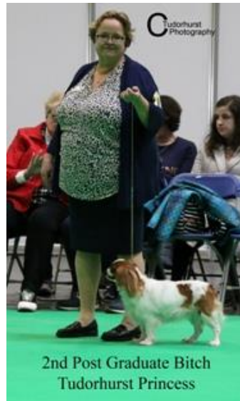
2nd Post Graduate Bitch Tudorhurst Princess