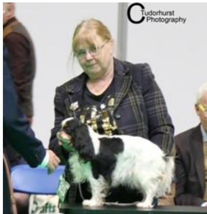
1st Post Graduate Bitch Celxo Absolutely Beautiful