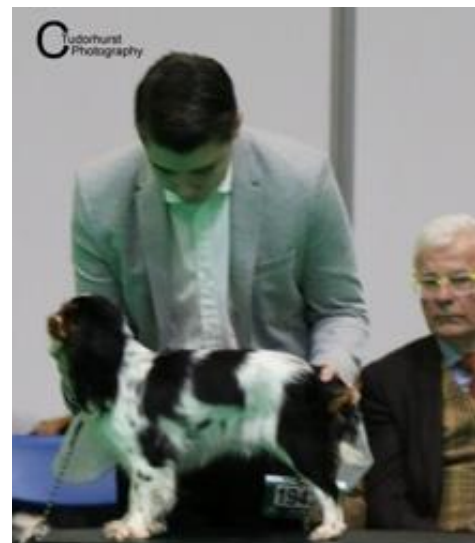
3rd Limit Bitch Ellemich Day Dream