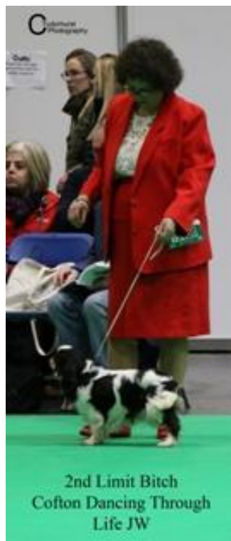
2nd Limit Bitch Cofton Dancing Through Life JW