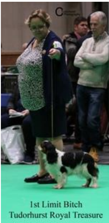
1st Limit Bitch Tudorhurst Royal Treasure