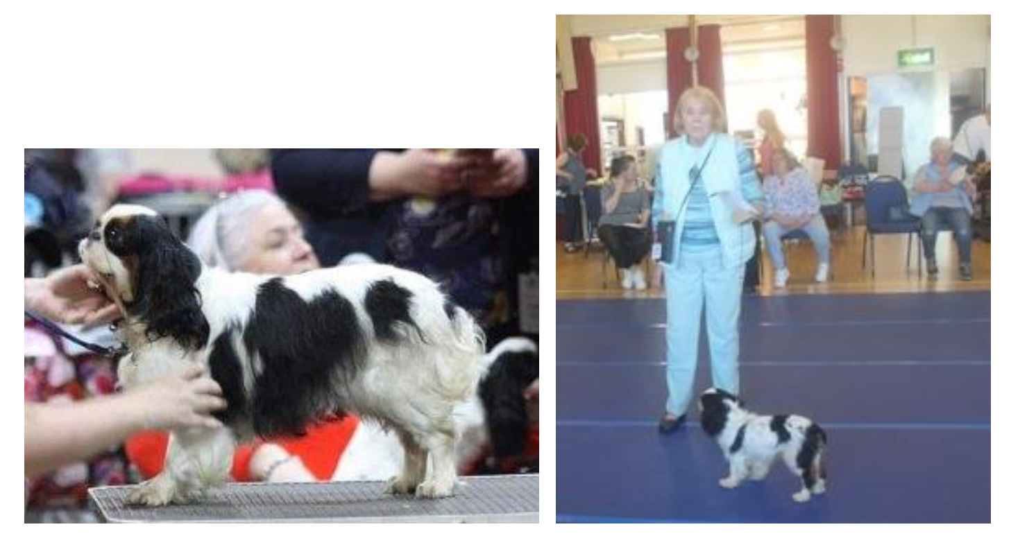
Special Open Blenheim / Tricolour Bitch 1<sup>st</sup> & 2nd