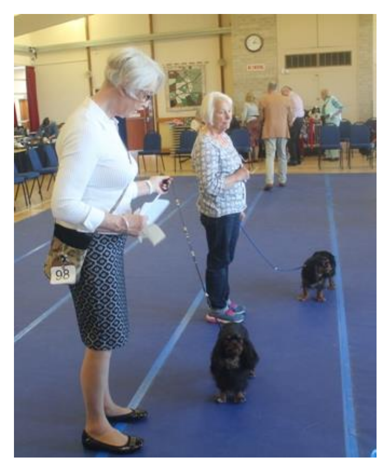
Special Open Black & Tan / Ruby Bitch Winners